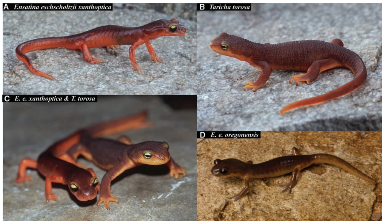
Figure 1. Photos of (A) the presumed mimic, Ensatina eschscholtzii xanthoptica ; (B) the presumed model, Taricha torosa ; (C) the presumed mimic ( E. e. xanthoptica ; left), and model ( T. torosa ; right) together; and (D) the experimental control, E. e. oregonensis , which lacks the aposematic colors and is considered cryptic (Stebbins 1949).

To test the hypothesis that E. e. xanthoptica benefits from reduced predation as a consequence of its supposed aposematic (orange and yellow) colors, Kuchta (2005) deployed clay salamander replicas in the field and recorded attack rates. He found that models possessing the yellow and orange colors were depredated significantly less often than models lacking the supposed aposematic colors, suggesting that E. e. xanthoptica benefits from aposematic coloration. The study, however, did not directly demonstrate that E. e. xanthoptica is an effective mimic of Taricha . In addition, E. e. xanthoptica possesses granular glands in its skin, with a particularly dense packaging of them in the tail, and therefore, if